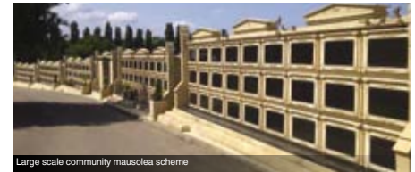
Large scale community mausolea scheme