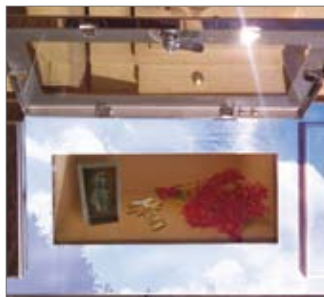
Keepsake niche option