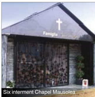
Six interment Chapel Mausolea