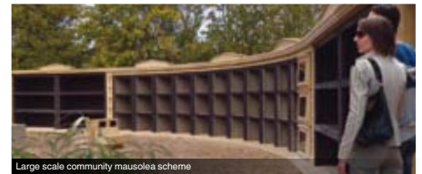
Large scale community mausolea scheme