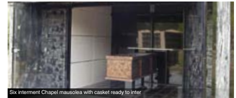
Six interment Chapel mausolea with casket ready to inter