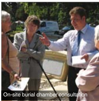
On-site burial chamber consultation

“heavy industries” to assist with the great post war re-construction effort. The largest settlement is in London with over 50,000 people of Italian birth residing followed by Manchester with 25,000.