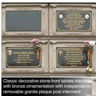
Classic decorative stone front tablets inscribed with bronze ornamentation with independently removable granite plaque post interment