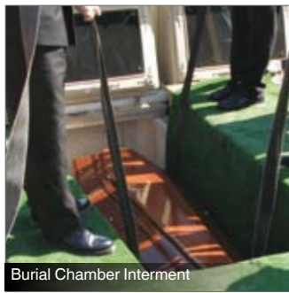
Burial Chamber Interment