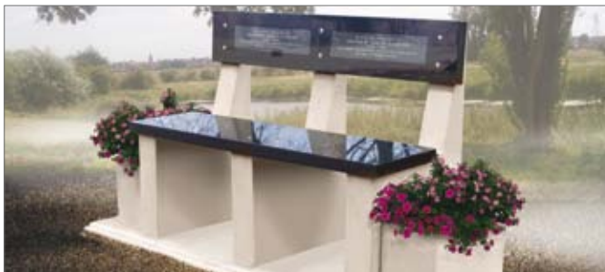
Memorial bench with extended base plinth and planters