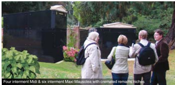
Four interment Midi & six interment Maxi Mausolea with cremated remains niches

There are many thousands of Italians now living in the UK with thriving communities and a well developed Anglo Italian or ‘Britalian’ cultural identity. Post war Italian settlers are traditionally known for their ice cream, fish and chips, pizza and pasta restaurants, delis and shops. There are also large “pockets” of Italian communities that settled and thrived within other more