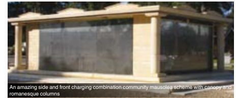
An amazing side and front charging combination community mausolea scheme with canopy and romanesque columns