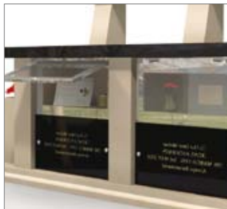
Niche and Keepsake arrangement