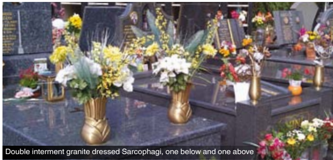
Double interment granite dressed Sarcophagi, one below and one above