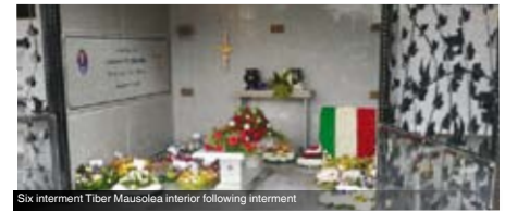
Six interment Tiber Mausolea interior following interment