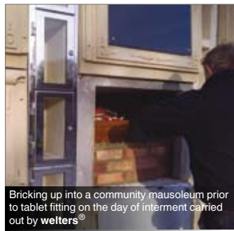
Bricking up into a community mausoleum prior to tablet fitting on the day of interment carried out by Welters®

The most common and enduring sense of comfort and reassurance that is drawn by the Italian community from our work with them is that they can realise their own comprehensive wishes. Bespoke personal design choices without complicated procedure, at a difficult time with the help of caring and expertise is the key to peace of mind. It is now well known that we have the ability to “make it all happen”. It is as common for us to be discussing the design and build of a large 12 interment walk-in family chapel mausoleum as it is to be cladding a single burial chamber with one memorial with