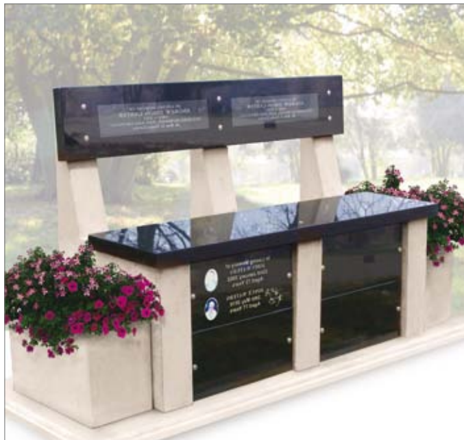
Memorial bench with full niche and planter specification