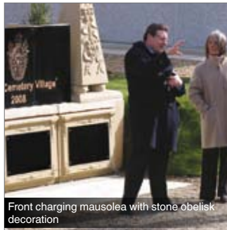
Front charging mausolea with stone obelisk decoration

memorial preferences specifically developed for the UK market are all essential factors to be considered professionally. In other words; we interpret the ideas of what they want without presuming what we think they should have. Our service is tailored to suit the needs of both the Italian community and the cemetery operator and is designed to work here on all levels.