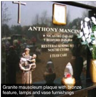
Granite mausoleum plaque with bronze feature, lamps and vase furnishings

As with “importing” any concept, system or procedure into this country (or any other for that matter) it is never a question of simply looking at that what occurs and how it is done in Italy and attempting to transpose that here, if that was the case everyone would find it achievable! It is absolutely critical to the relationship success that the “magic” ingredient is an integral part of the mix. What is the magic ingredient? We believe after many years that it is the ability to identify and implement design solutions and support services that are relevant interpretations. These issues naturally involve all factors like legislation, climate, material specification, unit cost spend ceilings, handling restrictions and procedures etc. Environmental issues, on-going maintenance and localised cultural interment and